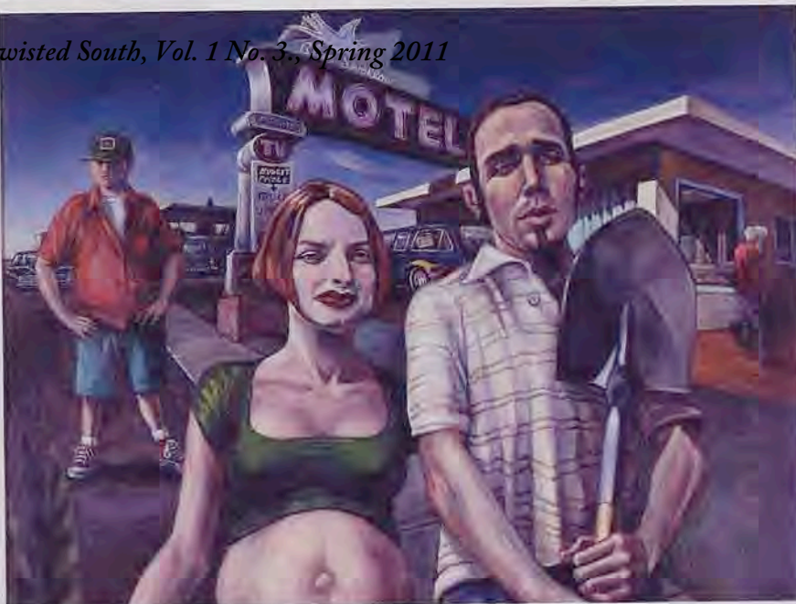
Neo American Gothic