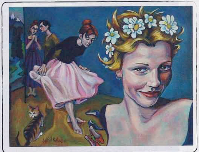
Clockwise from top: Road Trip , Shoe Shopping , and Alan Toussaint