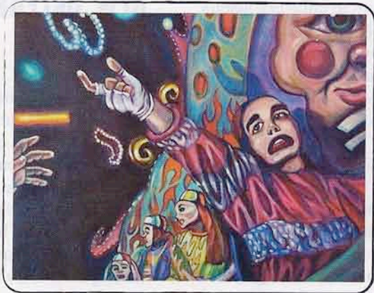
Clockwise from top: Blue Swallow , Fat Tuesday , and A Family Affair