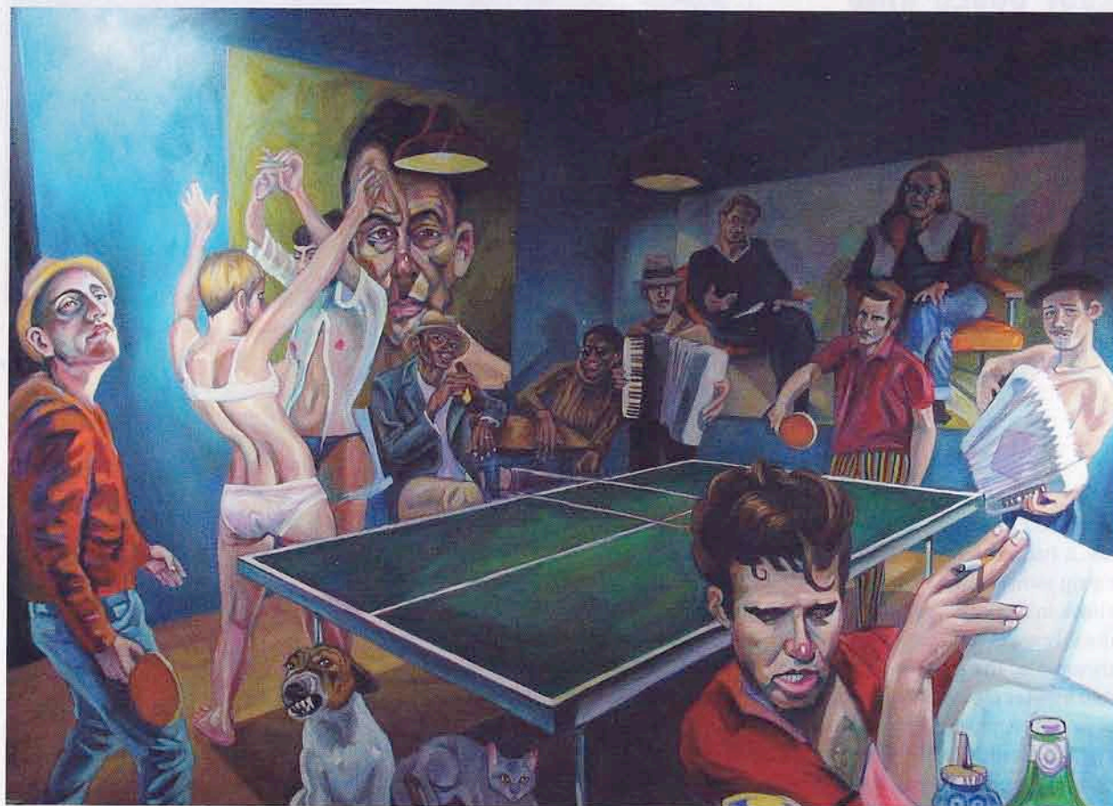
Waiting for the Ball to Drop