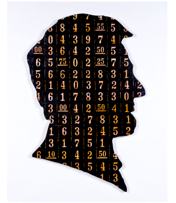
Skylar Fein, Black Lincoln/The Cotton Prices 2011. Acrylic on Plaster and Wood. 35" x 26.5"

Combs uses familiar elements of Americana and materials reminiscent of masculine icons such as Hemingway and Roosevelt. His work appears in collections of Parrish Art Museum, 21C Museum, Beth Rudin Dewoody, Klaus Kertess, and Marianne Boesky.